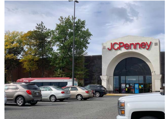
The JCPenney store at the Holyoke Mall at Ingleside, shown above in October 2018, is one of the mall's original tenants.

HOLYOKE — The Holyoke Mall at Ingleside, still the largest retail destination in Western Massachusetts, is celebrating 40 years in business.